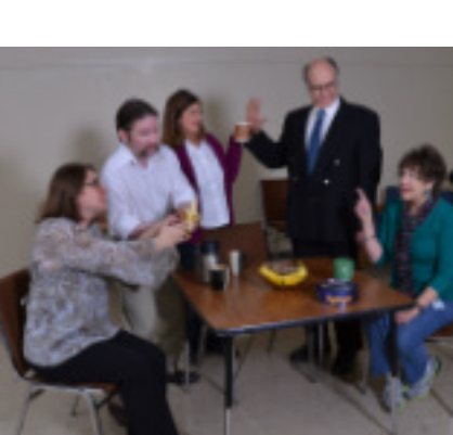
The full dysfunctional family in rehearsal.

Mel and Edna begin their arduous journey.